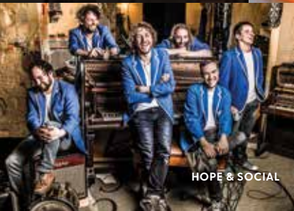
HOPE & SOCIAL